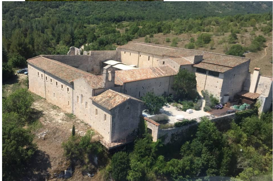
Monastery of Sant'Angelo Monastery of Santo Spirito